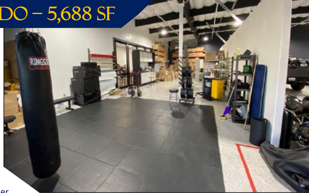
Prior User Photos